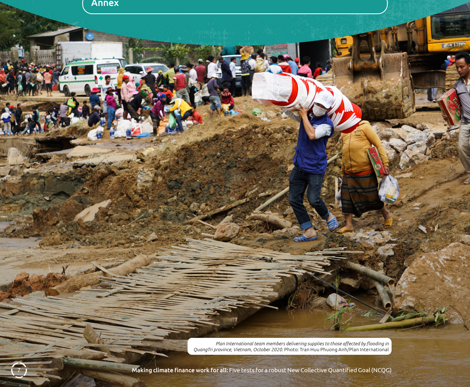
Plan International team members delivering supplies to those affected by flooding in QuangTri province, Vietnam, October 2020.