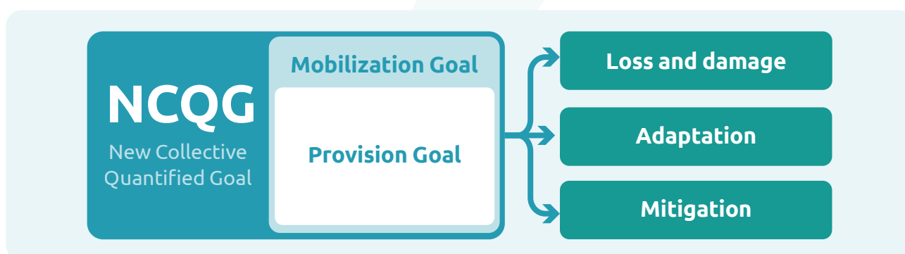
Figure 2: A proposed structure for the NCQG

The NCQG should also have thematic sub-goals, set in grant equivalent terms, for mitigation, adaptation, and loss and damage, to ensure a more equitable and balanced distribution of finance. Sub-goals will also ensure finance is not taken from one theme to fulfil commitments to other themes.