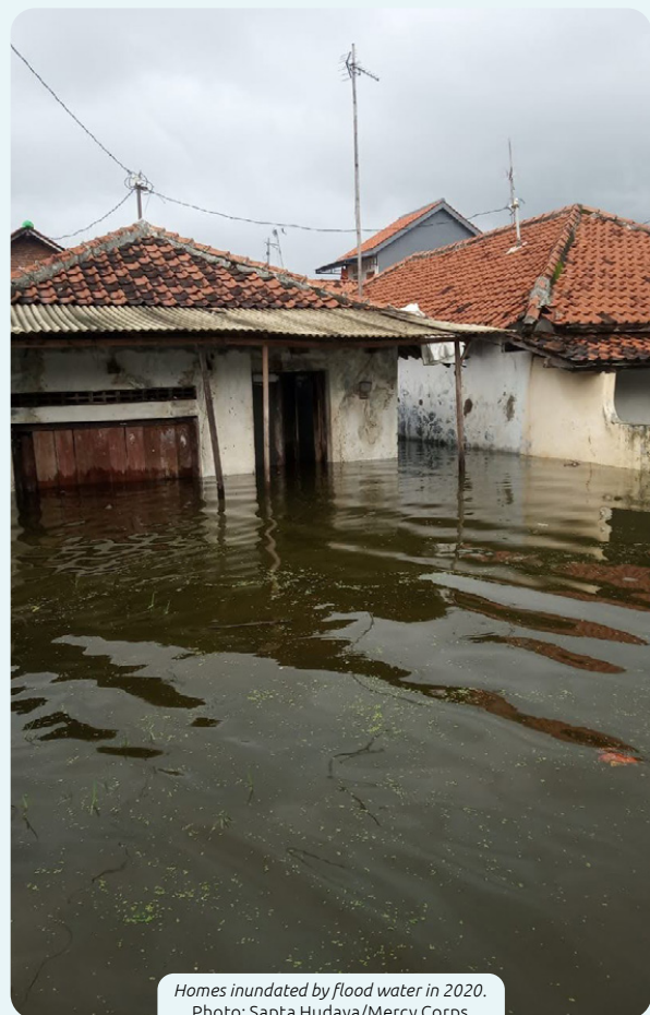
Homes inundated by flood water in 2020.

The Zurich Climate Resilience Alliance work in Indonesia enhances flood and climate resilience in 28 at-risk communities.