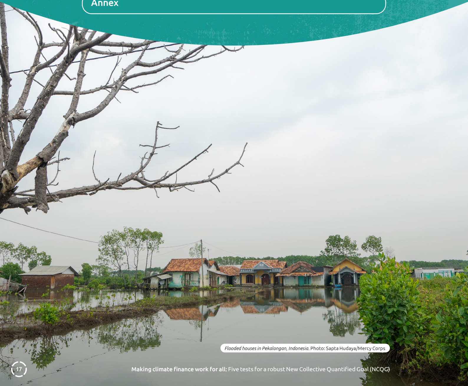
Flooded houses in Pekalongan, Indonesia.