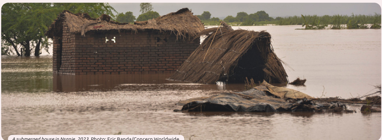
A submerged house in Nsanje, 2023.

The Zurich Climate Resilience Alliance work in Malawi enhances flood resilience in 35 communities. Our team helps develop and strengthen community-level plans and build the capacity of local actors.