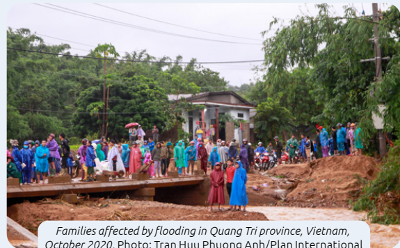
Families affected by flooding in Quang Tri province, Vietnam, October 2020.

The Zurich Climate Resilience Alliance work supports 18 communities in three districts of the Quang Tri Province which are highly vulnerable to climate-induced disasters, notably flooding.