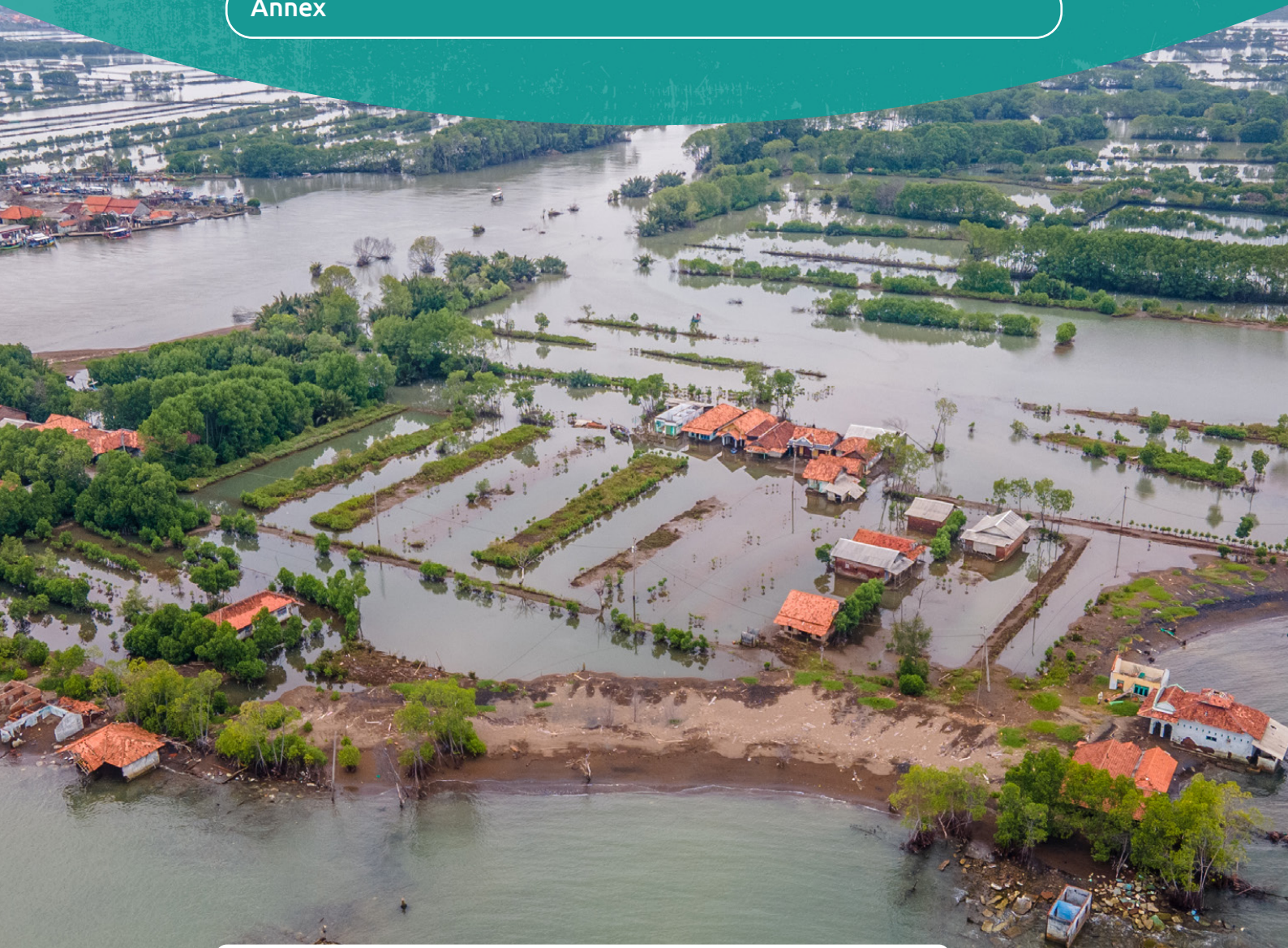
The village of Simonet in Pekalongan, Indonesia, now permanently inundated by flooding.