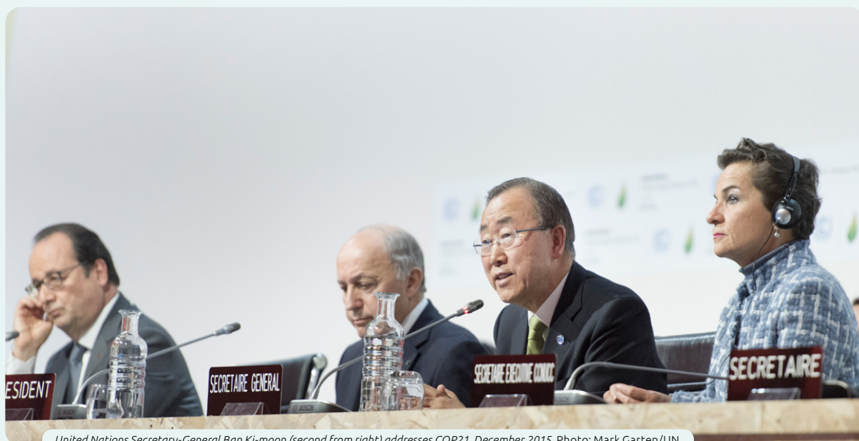
United Nations Secretary-General Ban Ki-moon (second from right) addresses COP21, December 2015.