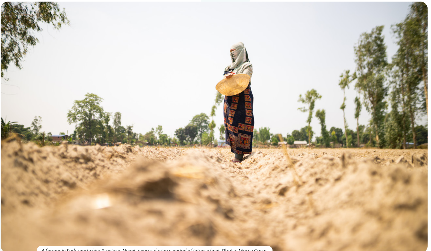
A farmer in Sudurpashchim Province, Nepal, pauses during a period of intense heat.