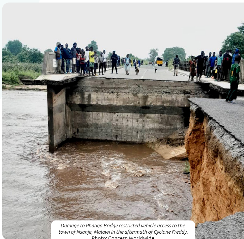
Damage to Phanga Bridge restricted vehicle access to the town of Nsanje, Malawi in the aftermath of Cyclone Freddy.

The legally binding 2015 Paris Agreement is of particular significance because it underpins the NCQG. Articles 2 and 9 of the Paris Agreement set out the core role of finance in driving climate action and create an obligation for developed countries to provide financial resources to developing countries. If countries are to interpret their treaty commitments in good faith, this obligation cannot be ignored. Indeed, as the second IHLEG report on climate finance put it: “ Failure to generate investment and finance of the scale and nature required is to fail on Paris. The consequences would be devastating, particularly for the poorest people. Seizing the opportunity would unlock the growth story of the 21 st century ” (Bhattacharya et al., 2023).