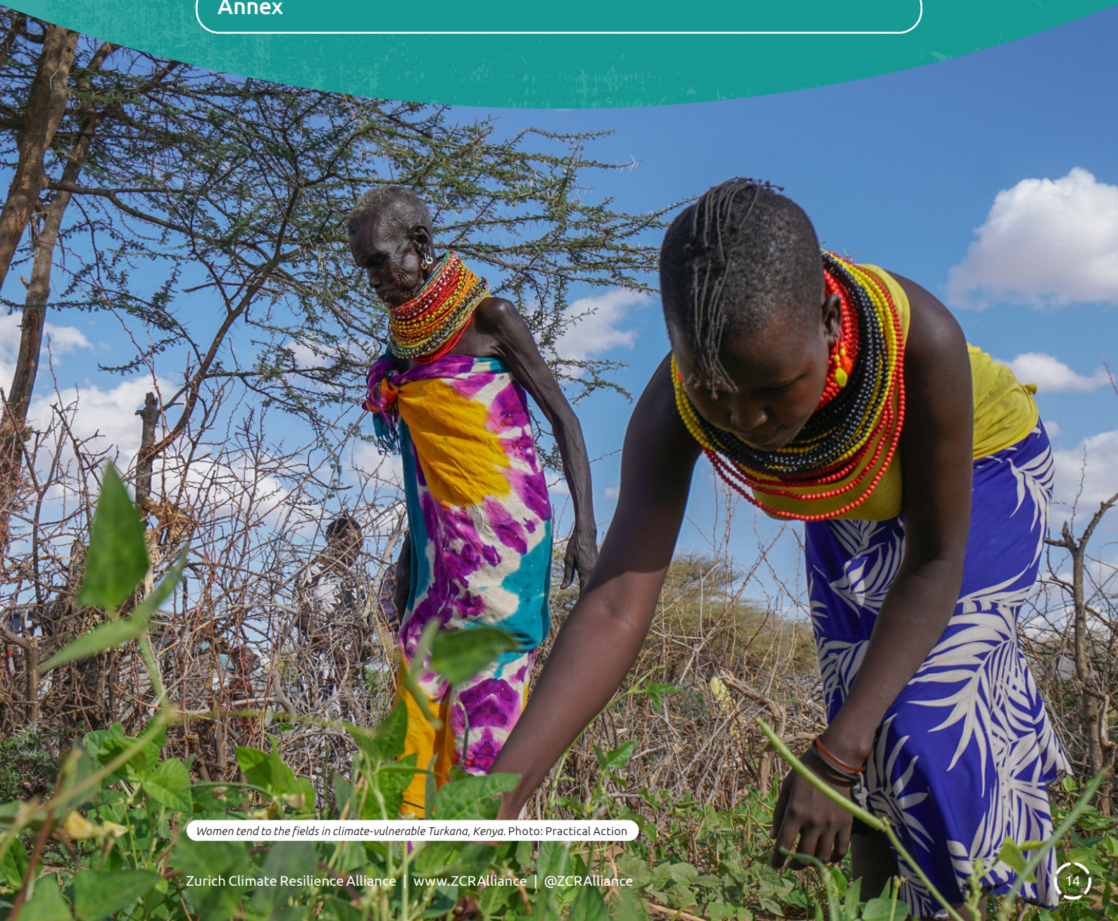
Women tend to the fields in climate-vulnerable Turkana, Kenya.