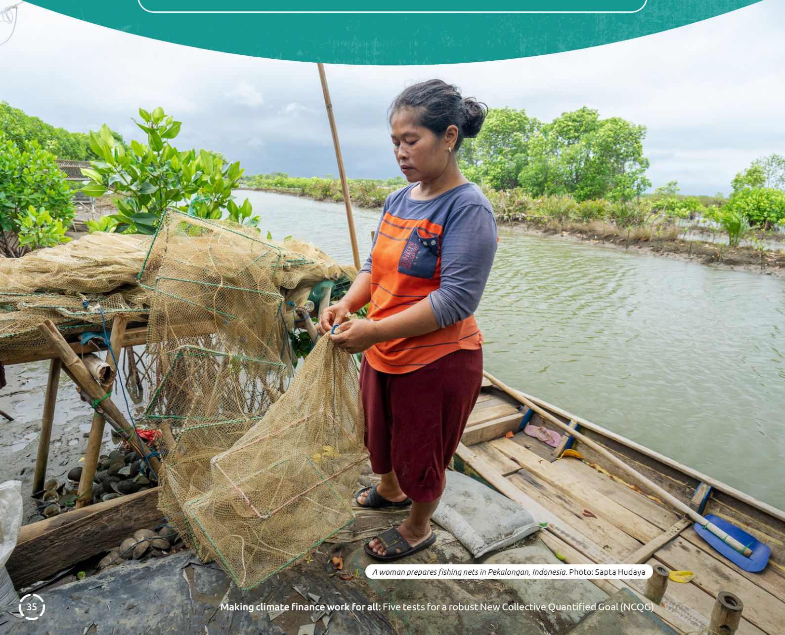
A woman prepares fishing nets in Pekalongan, Indonesia.