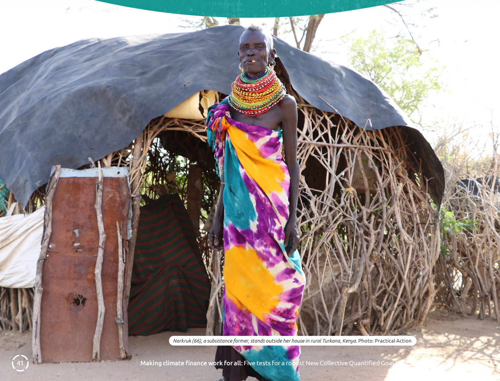
Narkruk (66), a subsistence farmer, stands outside her house in rural Turkana, Kenya.