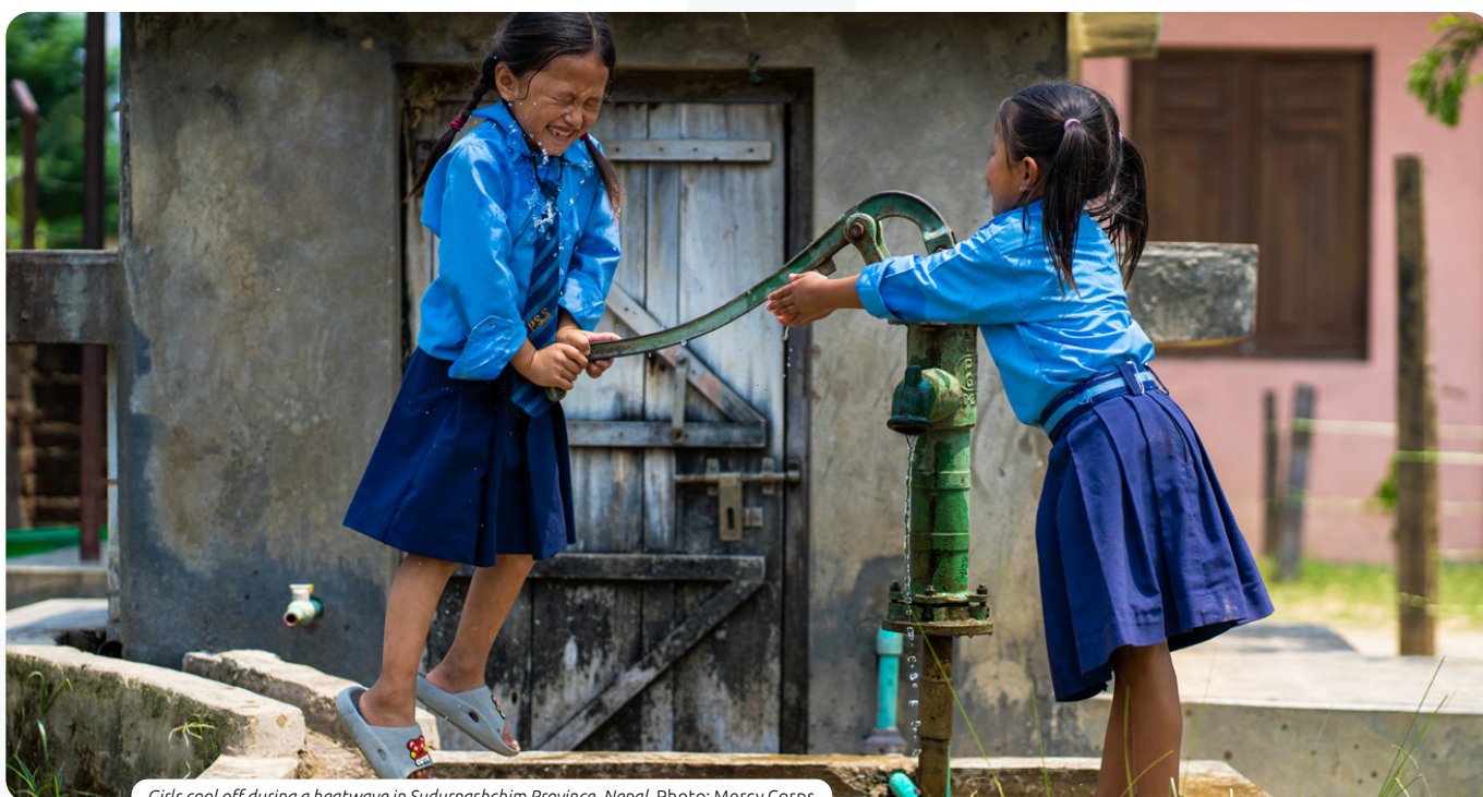
Girls cool off during a heatwave in Sudurpashchim Province, Nepal.

Achieving this is in the interest of all countries. It would restore trust in international climate negotiations, and give developing nations the support they need and have the right to under the UNFCCC. It would help put the whole world on a safer track towards a more stable climate and economy. And it would save lives, and restore some hope and dignity for communities around the world who are on the frontlines of the climate crisis.