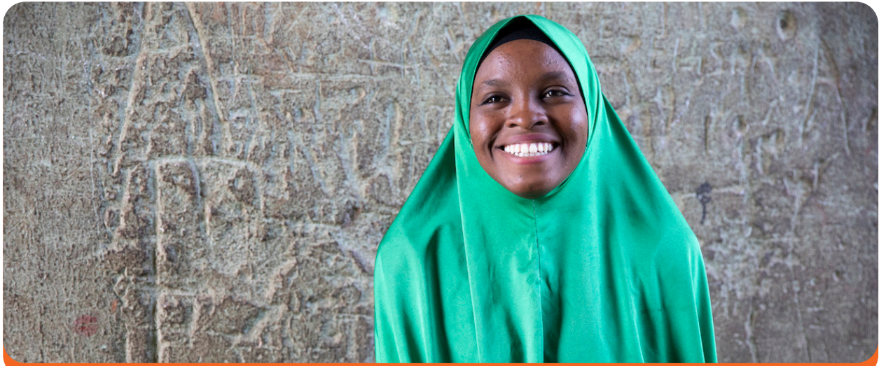
A young woman in Biu, Nigeria who saves income from her small sugar business in a VSLA.

complex and multidirectional. Recognizing that shocks are recurrent and vary in scale, magnitude, and impact is equally important for the well-being of conflict-affected populations.