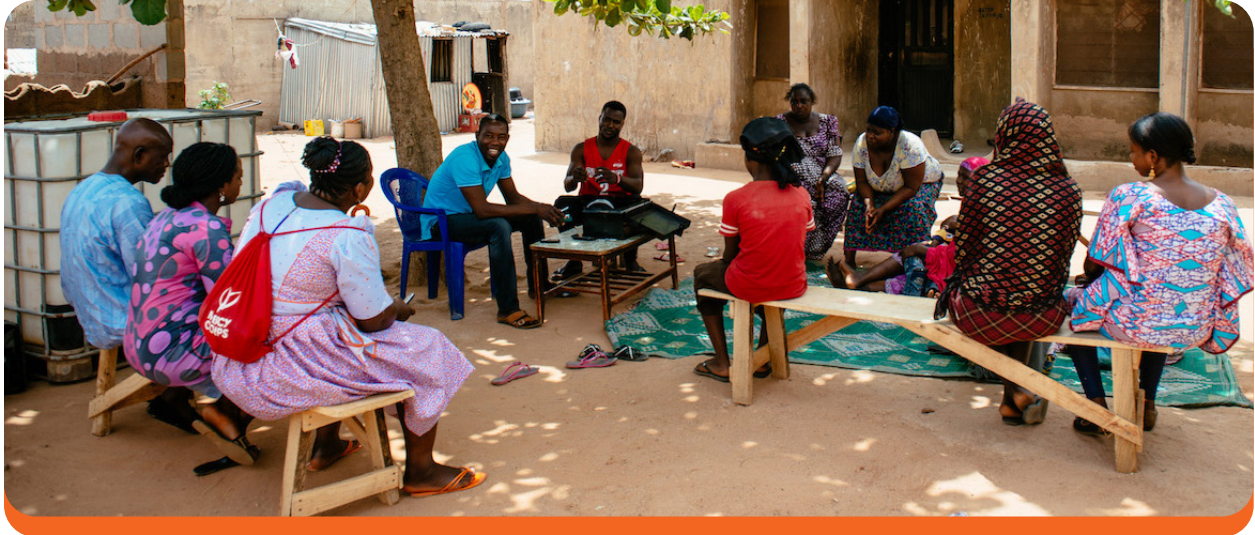
A savings group meets in Gombe. The group was established as part of a humanitarian response to the crisis in NE Nigeria.

Importantly, the bonds these social connections fostered promoted psychosocial well-being among women, and the well-being narratives cut across displacement divides. A program staff member elaborated on the psychosocial impact for displaced women: