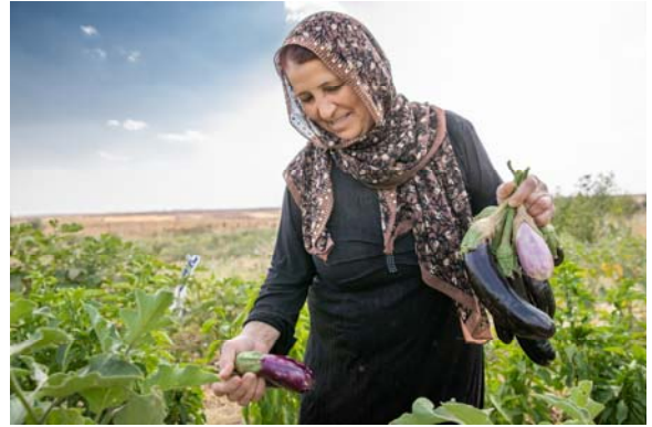
Ezra Millstein for Mercy Corps, Syria