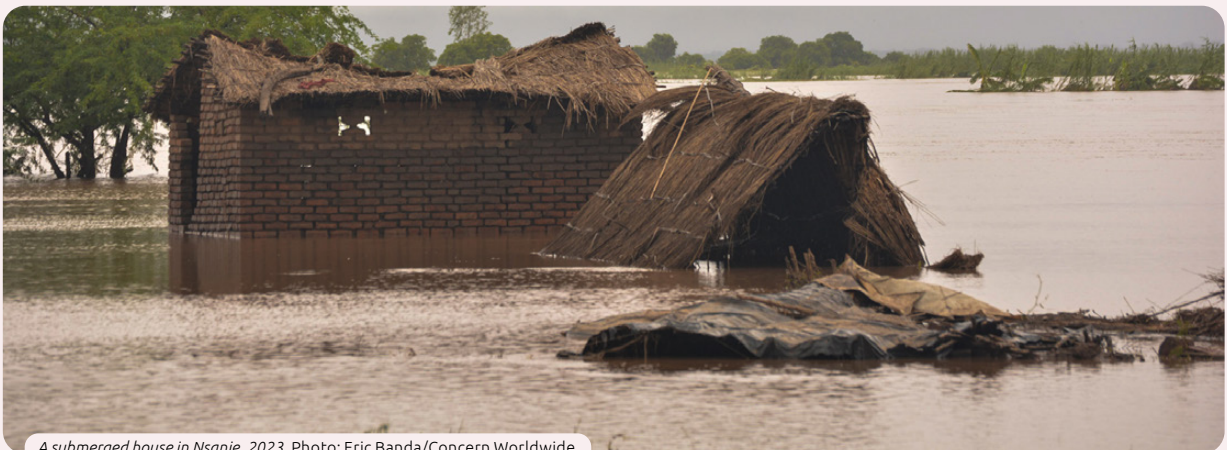
A submerged house in Nsanje, 2023.

The Zurich Climate Resilience Alliance work in Malawi enhances flood resilience in 35 communities. Our team helps develop and strengthen community-level plans and build the capacity of local actors.