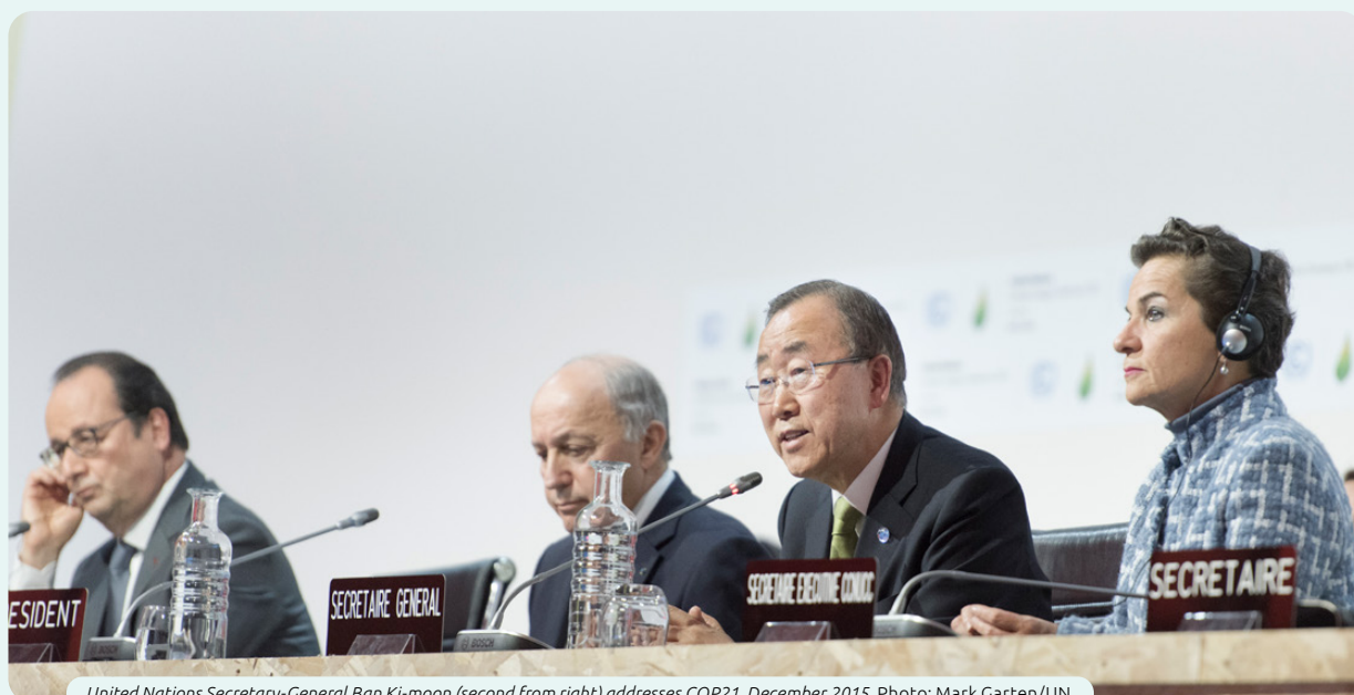
United Nations Secretary-General Ban Ki-moon (second from right) addresses COP21, December 2015.