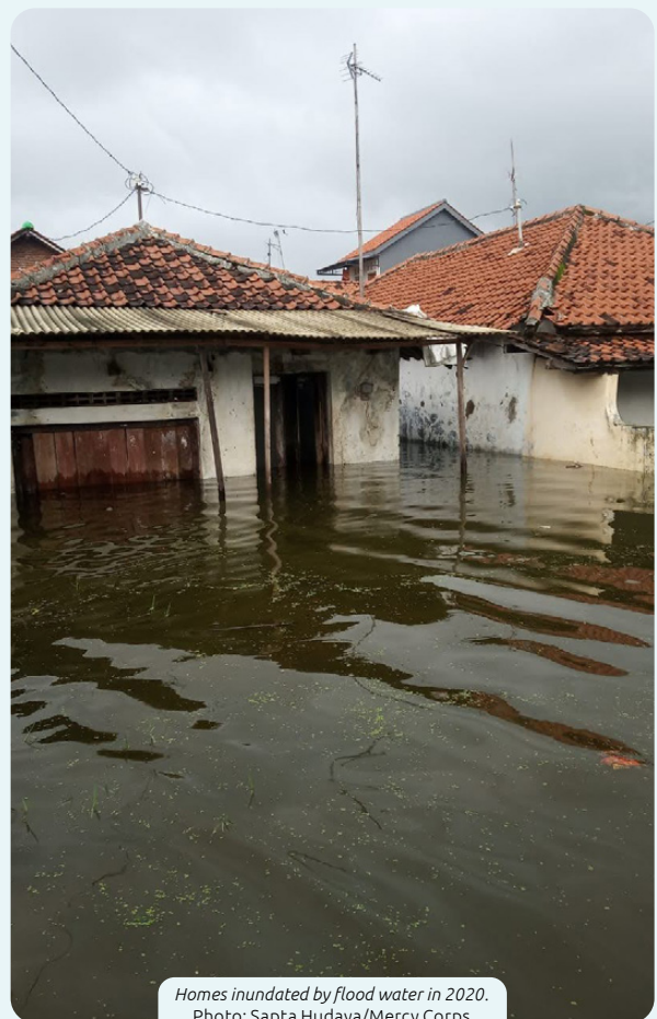
Homes inundated by flood water in 2020.

The Zurich Climate Resilience Alliance work in Indonesia enhances flood and climate resilience in 28 at-risk communities.