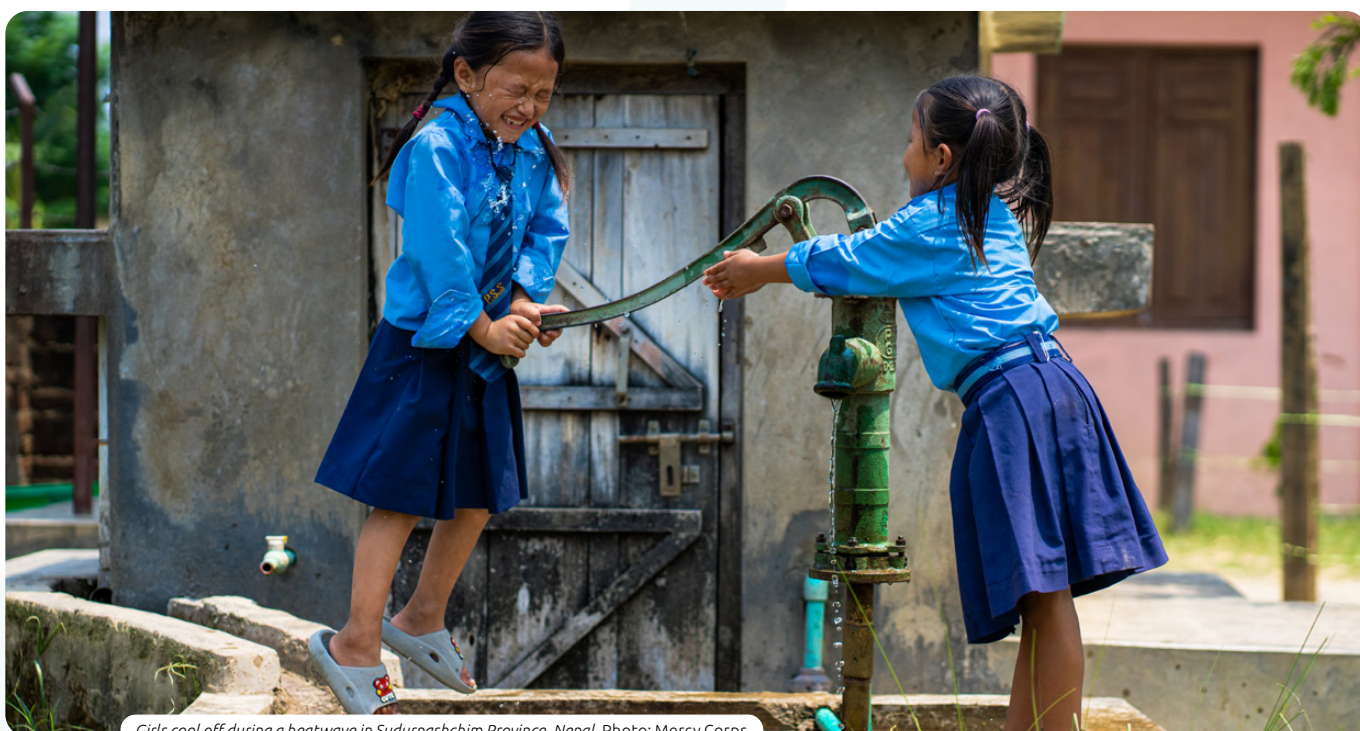
Girls cool off during a heatwave in Sudurpashchim Province, Nepal.

Achieving this is in the interest of all countries. It would restore trust in international climate negotiations, and give developing nations the support they need and have the right to under the UNFCCC. It would help put the whole world on a safer track towards a more stable climate and economy. And it would save lives, and restore some hope and dignity for communities around the world who are on the frontlines of the climate crisis.