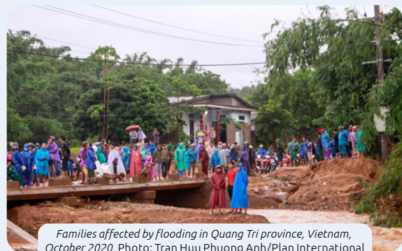
Families affected by flooding in Quang Tri province, Vietnam, October 2020.

The Zurich Climate Resilience Alliance work supports 18 communities in three districts of the Quang Tri Province which are highly vulnerable to climate-induced disasters, notably flooding.