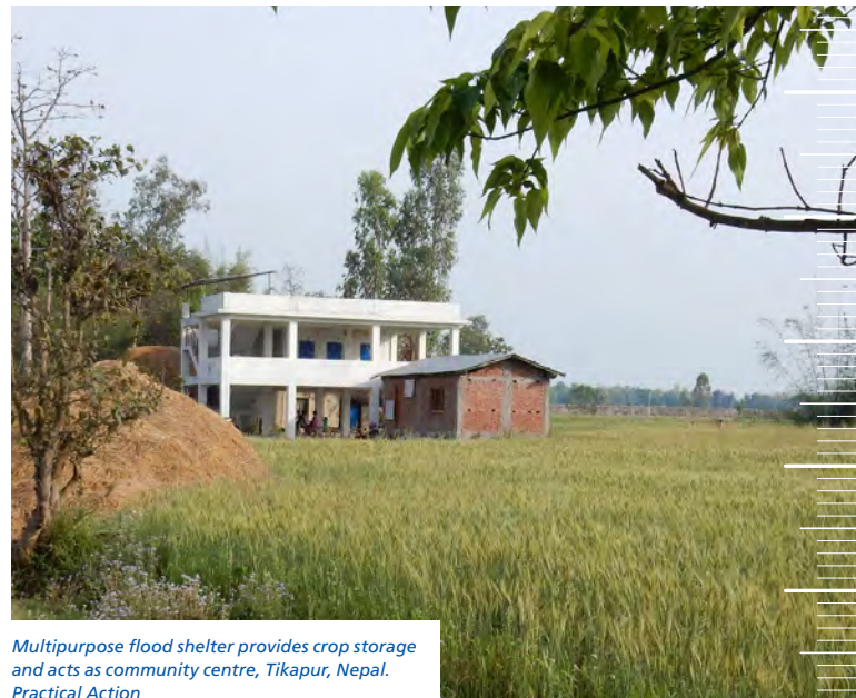
Multipurpose flood shelter provides crop storage and acts as community centre, Tikapur, Nepal. Practical Action

The first step in quantifying resilience impacts is a mapping exercise of what possible costs and benefits could arise from a resilience intervention. For example, the Nepal Flood Resilience Project (NFRP) implemented by Practical Action from 2013 to 2018 used the Flood Resilience Measurement for Community (FRMC) framework and tool developed by the Zurich Flood Resilience Alliance (Keating et al., 2016) to help communities holistically plan resilience-building activities for the vulnerable people of the Karnali floodplains in western Nepal (Regan, 2018).