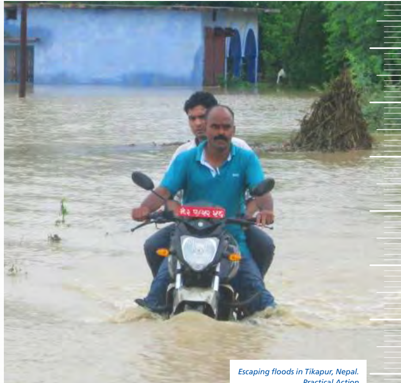
Escaping floods in Tikapur, Nepal.

Decision-support tools are useful for identifying and communicating these multiple dividends. Making the case now is important in the context of climate change, which is increasing risks, and at a time of massive global investment in infrastructure that needs to be made disaster-proof and climate-smart.