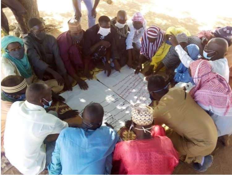
Training in conflict management mechanisms, Marke Dori & Marke Douna villages, December 30, 2020

between communities has been a destabilizing factor in Tillabéri, people's attitudes towards government forces also seem to influence their attitudes about violence, which is particularly important in a region where people have few opportunities to meaningfully engage with state actors outside of those responsible for security.